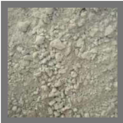
Monolithic Castable Refractory