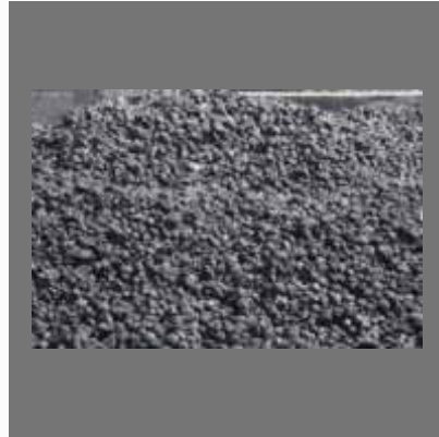
Raw Pet Coke