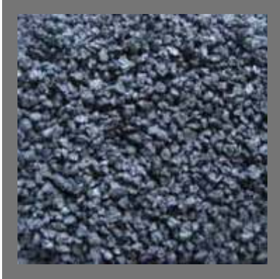
Calcined Petroleum Coke