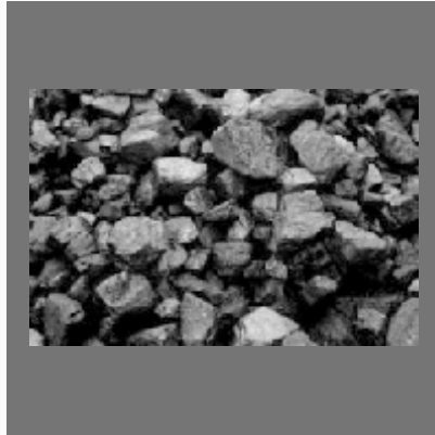
South African Coal RB2