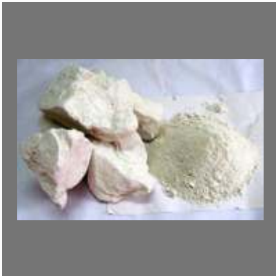
China Clay Kaolin