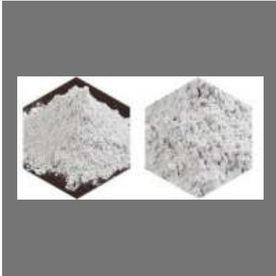
High Alumina Refractory Binder