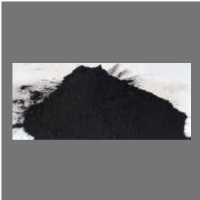
Petroleum Coke Powder