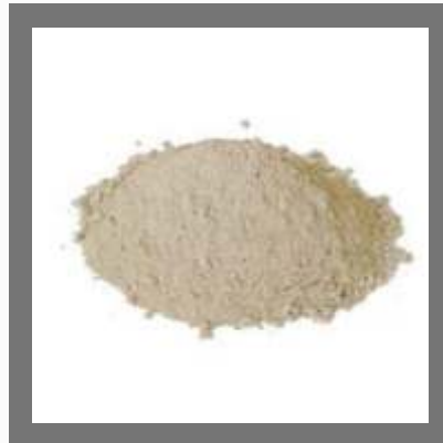
Fire Clay Mortar