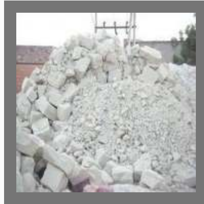
White China Clay