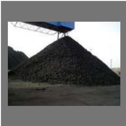
Metallurgical Coke Fines