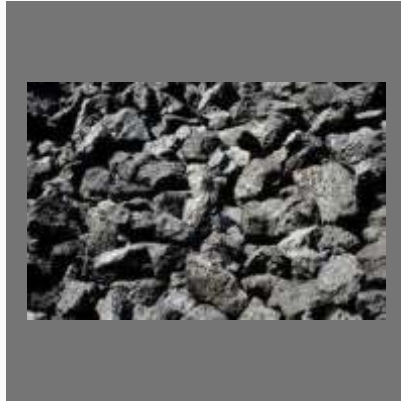
Low Ash Metallurgical Coke