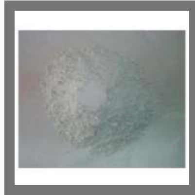
High Alumina Refractory Binder