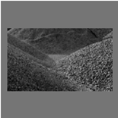
South African Coal RB3